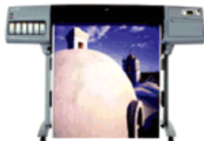
HP 5500 INKJET PRINTER