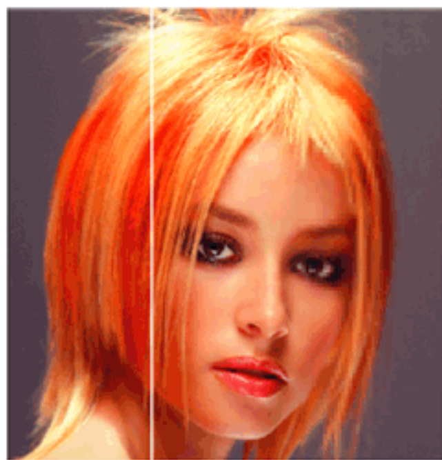
High Resolution Med Resolution Low Resolution

The following image shows the effects of insufficient resolution on your graphics.