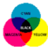
CMYK for Inkjet Prints

There are three basic color models for graphics: CMYK, RGB and spot color/Pantone.