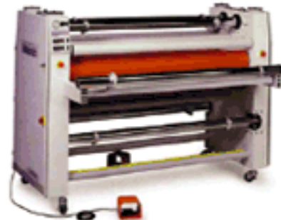
SEAL 5500 LAMINATOR

If your graphic is of a special type, such as a tiled mural or a Duraclear print, or is irregularly shaped, please call the Graphics Department for special instructions.