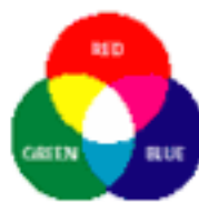
RGB for Lambda/Duratrans